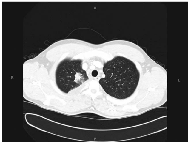
Figure 3. Computed tomography scan of the chest of patient 3 showing a right apical mass.

The patient presented to our tertiary care hospital with con-