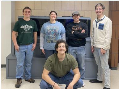
2024 Executive Board

In addition, our membership expanded significantly in the last year because of our joint meetings with The Wildlife Society.