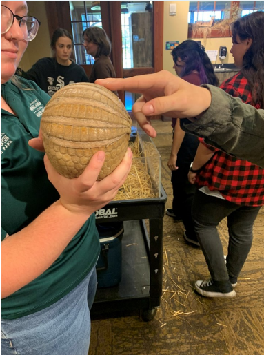
Animal encounters at WOW