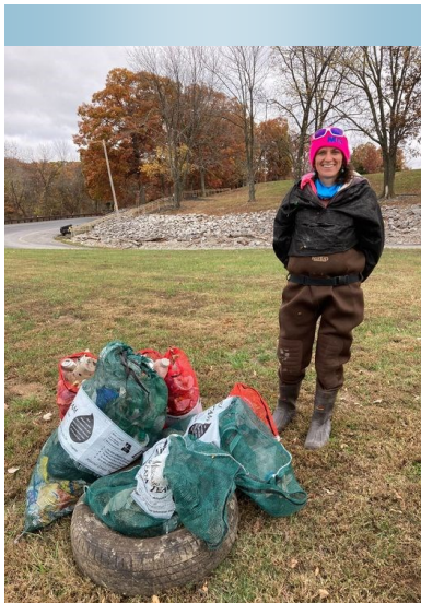
Salt River Cleanup

MOAFS has partnered with Stream Teams United in the past three years to host a day to visit the Missouri State Capitol. This year's "Great Rivers State Day" is scheduled for April 18th. Consider attending this day as a member of MOAFS!