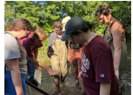
Jordan Creek underground tour